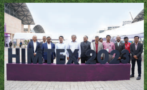
HIMTEX 2023 WHERE MACHINES WHIR AND IDEAS STIR 30