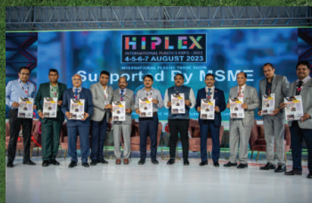
HIPLEX 2023 SHAPING THE FUTURE OF PLASTIC EXPOS 18