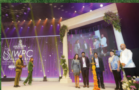
SIWPC GLOBAL 2023 CELEBRATING AUSPICIOUS BEGINNINGS 12